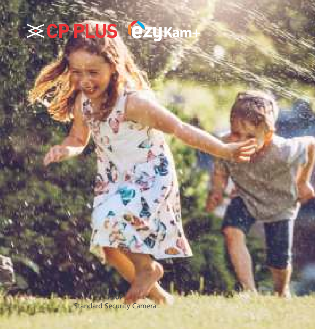
Standard Security Camera