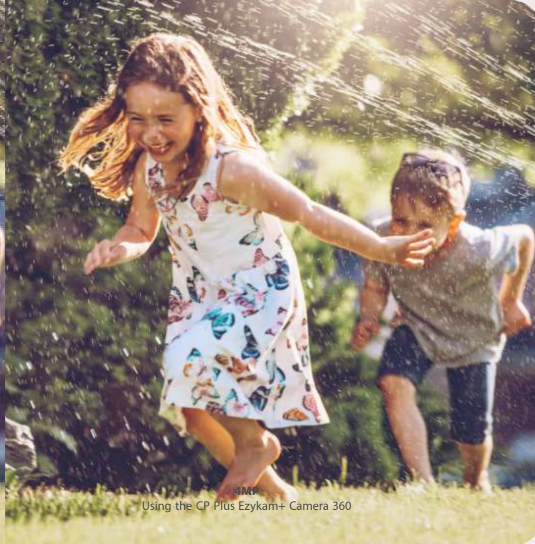
4MP Using the CP Plus Ezykam+ Camera 360