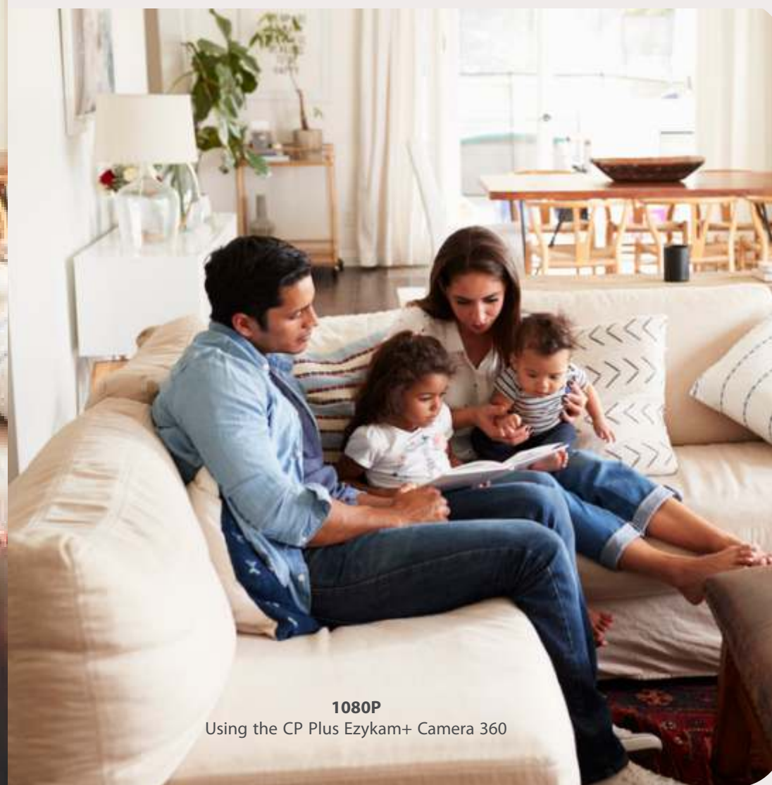
1080P Using the CP Plus Ezykam+ Camera 360